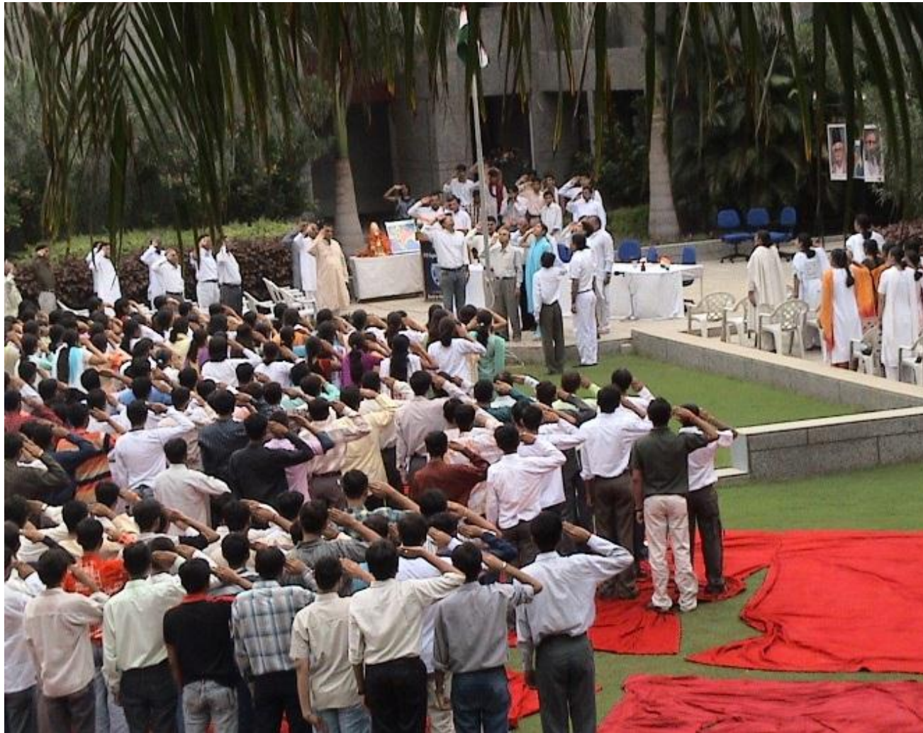
Students, Faculty members along with Administrative People Gathered together for the flag hosting.