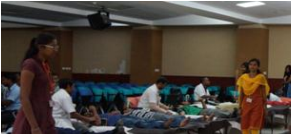
Volunteers donating blood

40 NSS volunteers assisted the doctors of IRCS in conducting the event in a very well planned manner. The programme started at 9.00am and continued till 3.30pm. 350 students and 40 faculties of MVJCE donated blood out of 420 people who had come forward to participate. The doctors and staff of IRCS appreciated the volunteers for making this programme a grand success by giving good publicity about the event in college campus and assisting them. They also thanked Principal and Management of MVJCE for their support for this event. The grand success of the programme put confidence in the heart of volunteers and they were proud of social work they have done. The NSS team would like to thank our Management, Principal, NSS officer and VTU for providing the opportunity and support till the end of the programme and making it a grand success.