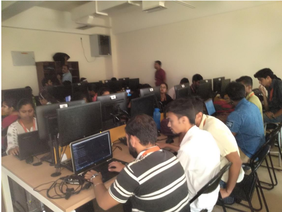
participants performing live coding along with the trainer Hands on session in Elixir Programming held on 5th may 2018 at CGV lab in CSE department