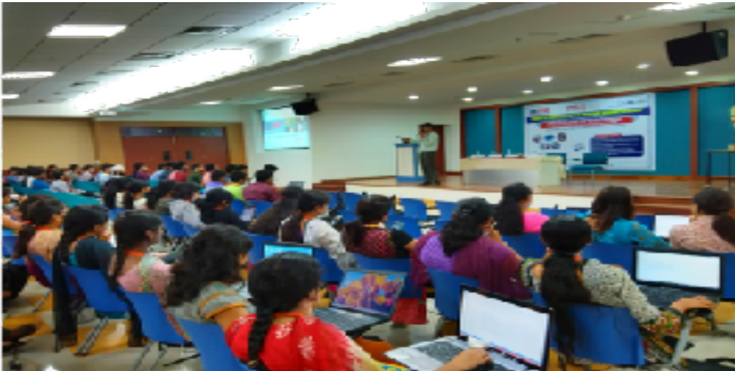
Participants during the session