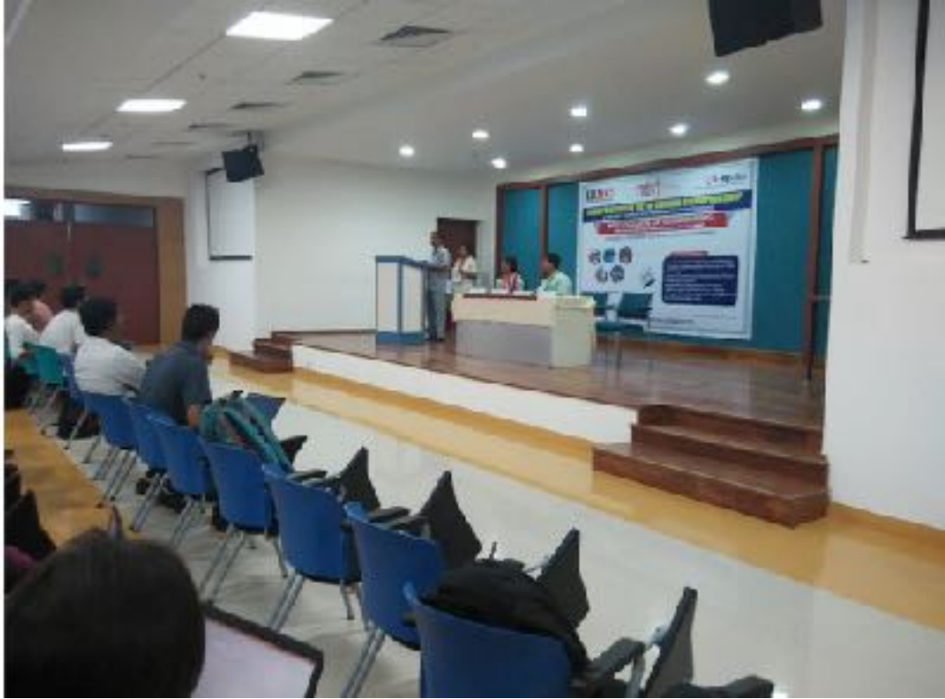
Advisor of MVJCE addressing the students