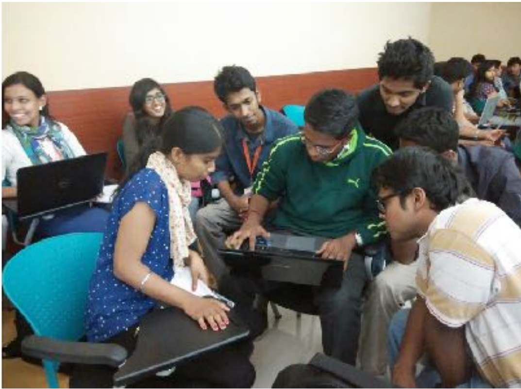
CISCO trainers interacting with students