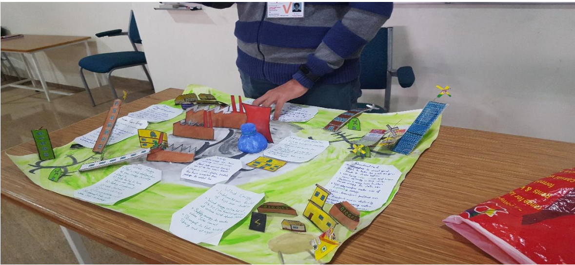
(iv) DEPICTION THROUGH CHART (VI SEM)