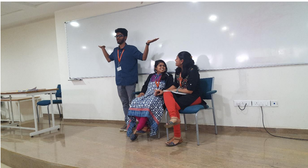
(v) STUDENTS ADVERTISING THEIR PRODUCT (SOLAR TREE)(IV SEM)