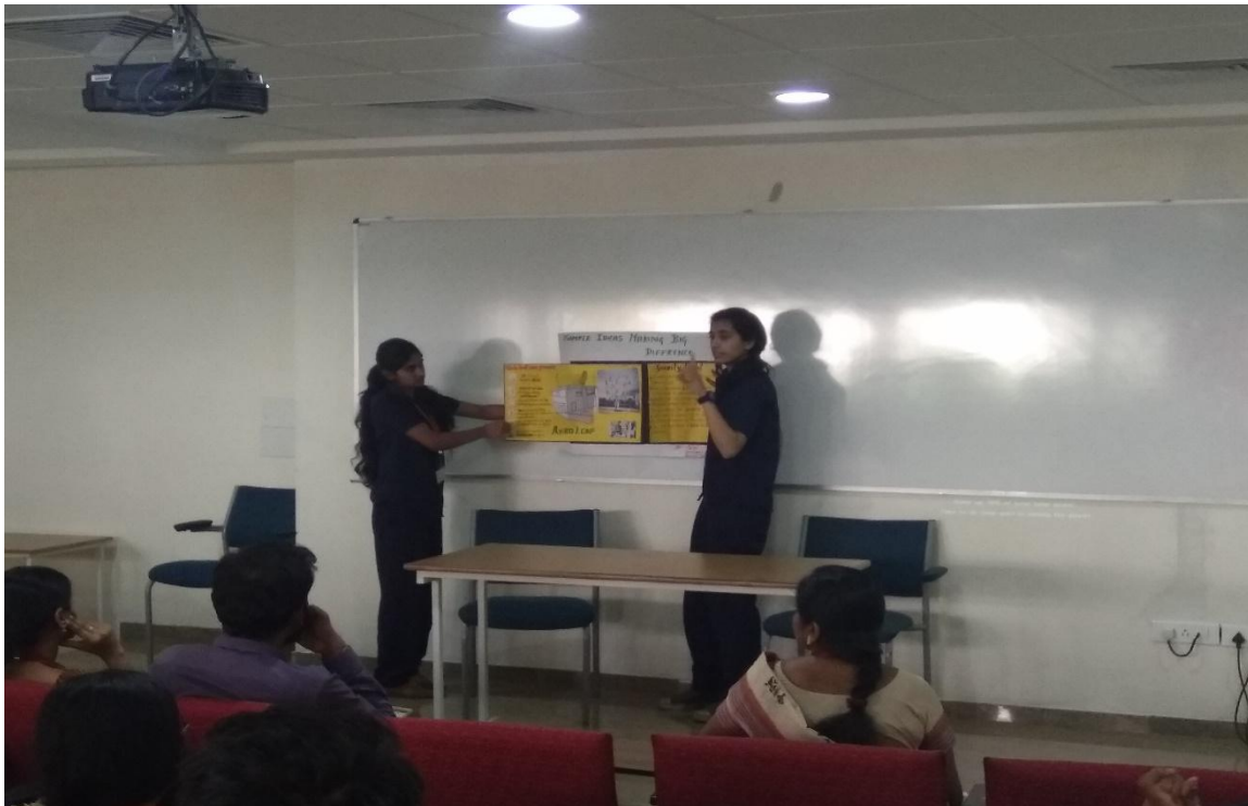
(i) EXPLANATION OF CHART BY THE STUDENTS (IV SEM)