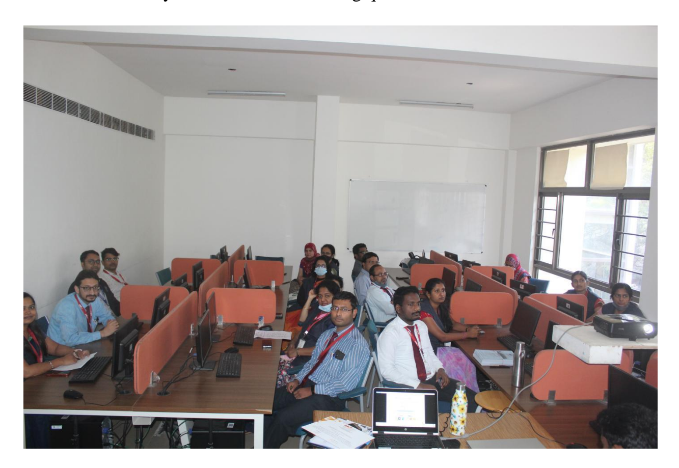
Faculties involving in the Coding Level challenge using LabVIEW.

architecture, Producer - Consumer Architecture, Coding pattern question discussions. Then on this day the faculties started solving many advanced coding level tasks and they were involved in coding questions.