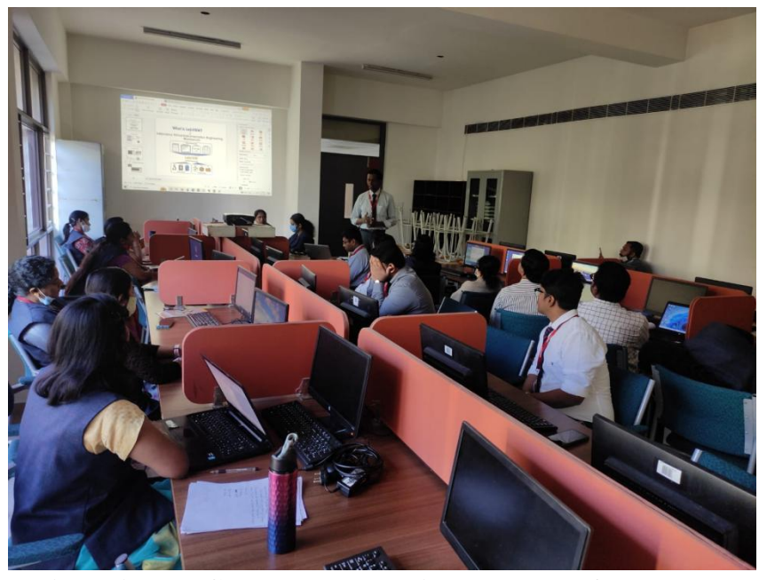
Discussion on Core I Programming concepts of LabVIEW